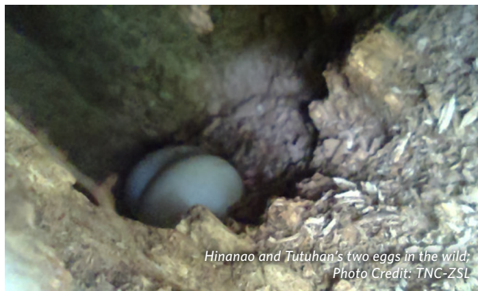
Hinanao and Tutuhan's two eggs in the wild

Earlier this year, the Aviary's Sihek Recovery Program partners, who are on the ground in Palmyra Atoll monitoring the nine sihek that were released in August of last year, shared reports of laid eggs, marking the first time the species has bred in the wild since their extinction from their native island of Guam in the 1980s.