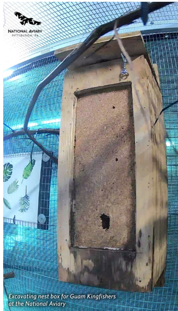
Excavating nest box for Guam Kingfishers at the National Aviary