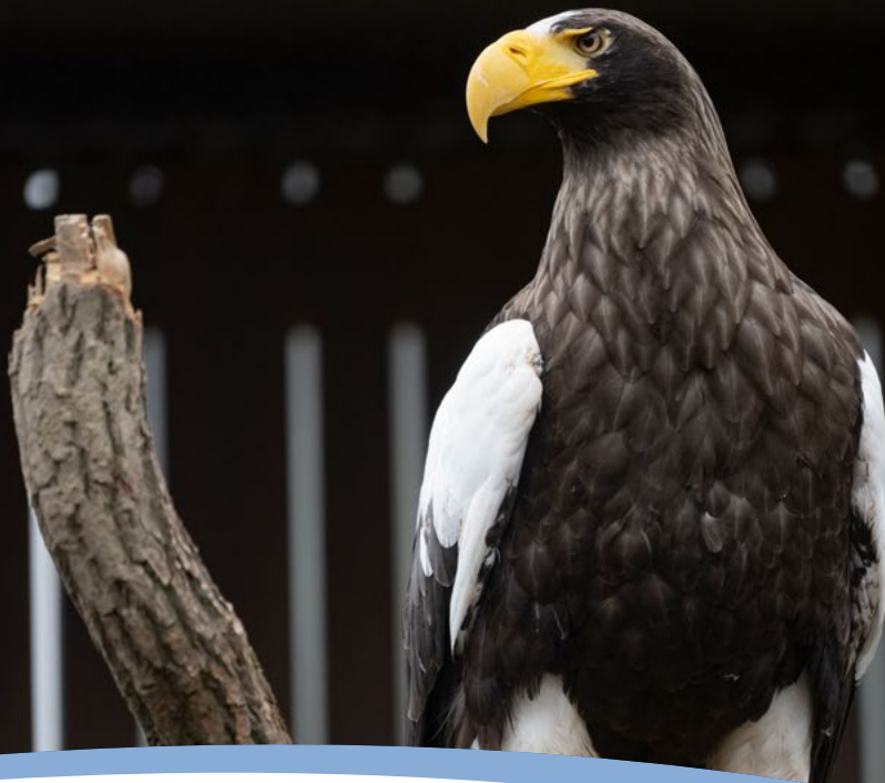
Kodiak, the Steller's Sea Eagle, perched in his habitat