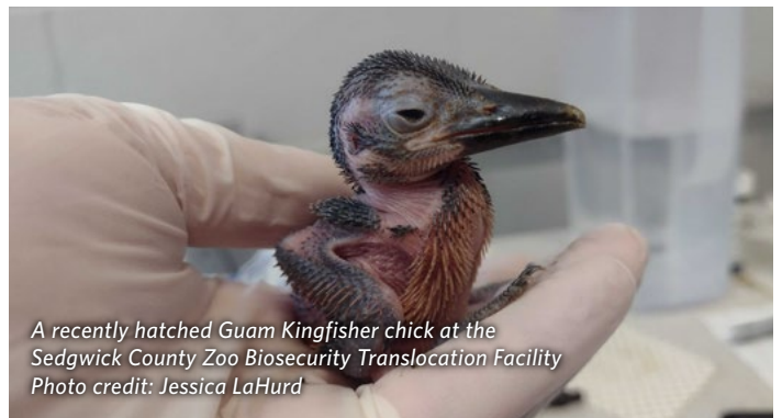
A recently hatched Guam Kingfisher chick at the Sedgwick County Zoo Biosecurity Translocation Facility