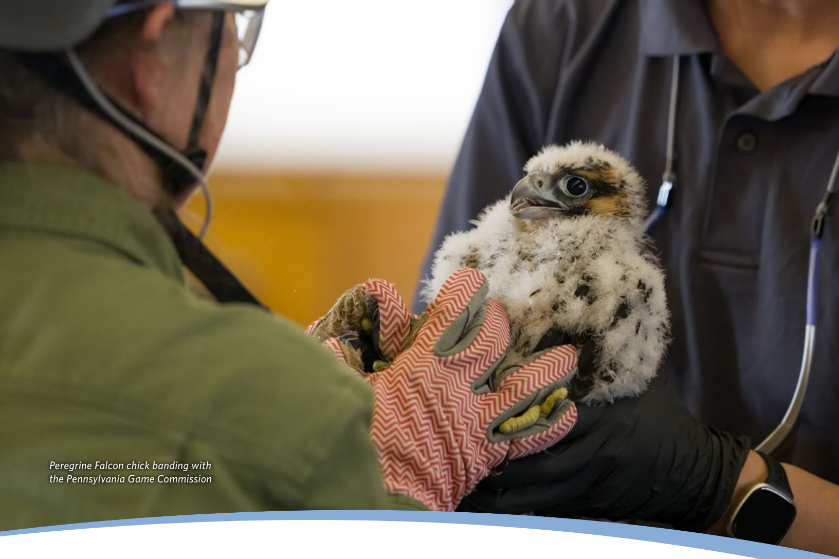
Peregrine Falcon chick banding with the Pennsylvania Game Commission