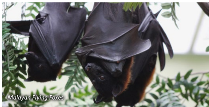
Malayan Flying Foxes

As the seasons change, so do the experiences you'll have when visiting the National Aviary. Autumn at the Aviary brings brand-new programming included with admission. This fall, you'll have not one but TWO opportunities to learn more about the fascinating creatures that inhabit these fantastical-like woodlands. First, "fly" to the Helen M. Schmidt FliteZone™ Theater and become immersed in the magical world of one of the world's most mysterious birds, the Owl, PLUS explore biofacts and learn all about some of Pennsylvania's most common Nocturnal Neighbors .