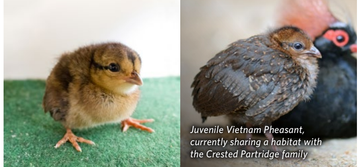
Juvenile Vietnam Pheasant, currently sharing a habitat with the Crested Partridge family