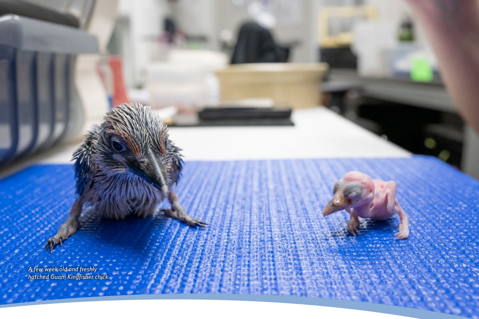
A few week old and freshly hatched Guam Kingfisher chick