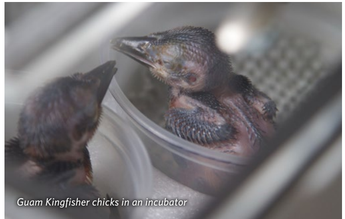
Guam Kingfisher chicks in an incubator