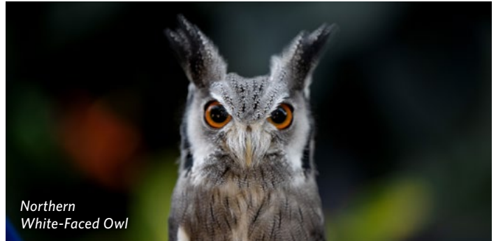
Northern White-Faced Owl