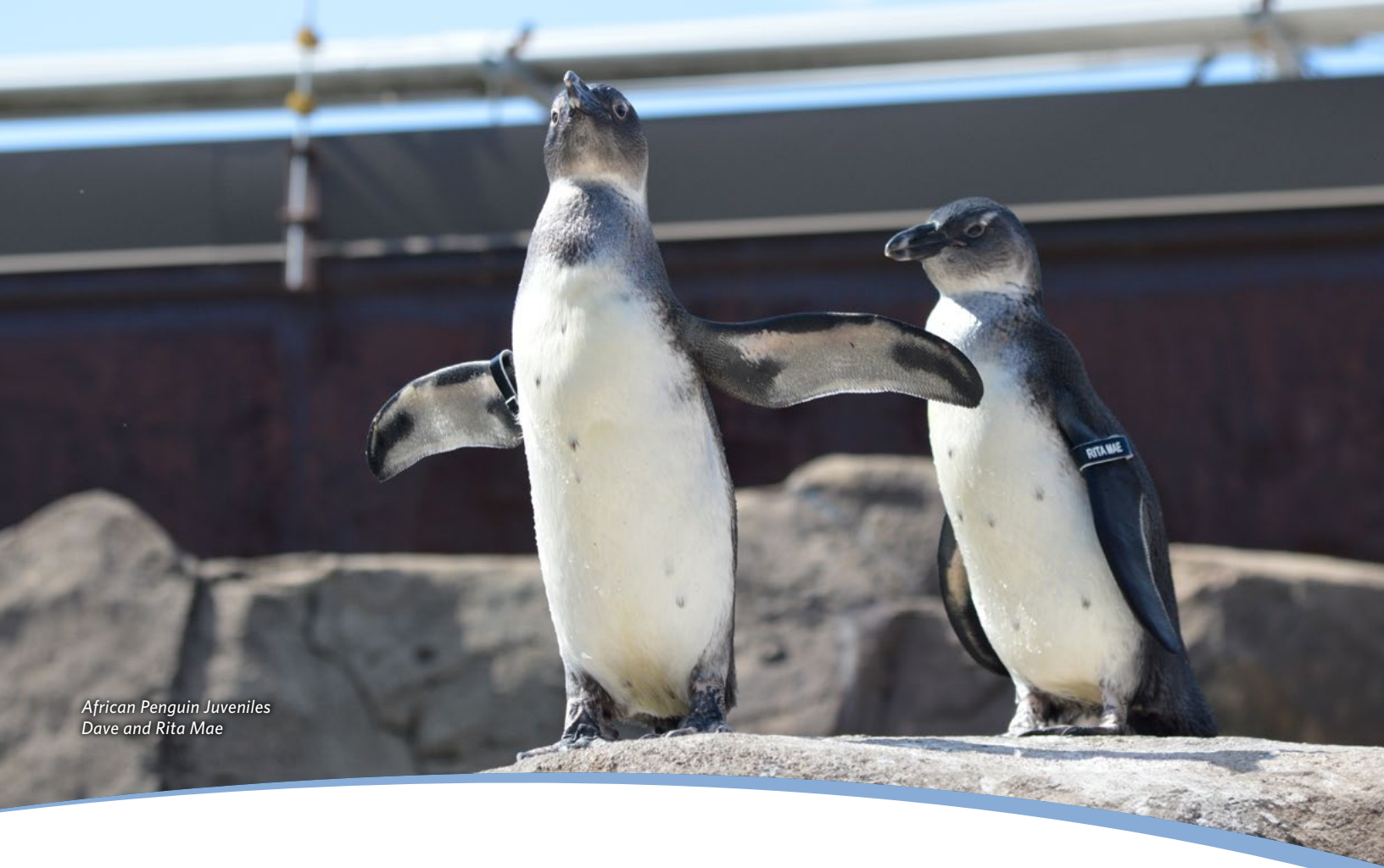
African Penguin Juveniles Dave and Rita Mae