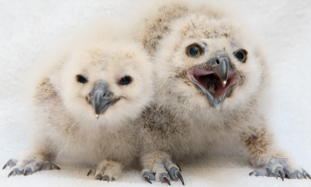
Two Eurasian eagle owl chicks who hatched at the National Aviary in 2018.