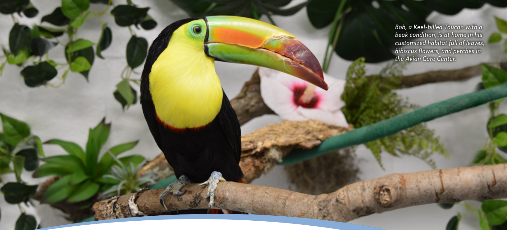
Bob, a Keel-billed Toucan with a beak condition, is at home in his customized habitat full of leaves, hibiscus flowers, and perches in the Avian Care Center.