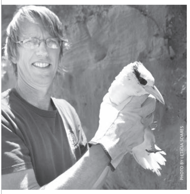
The editor captured this Red-billed Tropicbird chick in order to get a small blood sample for a study of avian malaria.

In addition to being a favorite local and regional attraction for the city of Pittsburgh, the National Aviary strives to stand out as a leader in advancing global conservation of birds and their habitats through ecological research and environmental education.