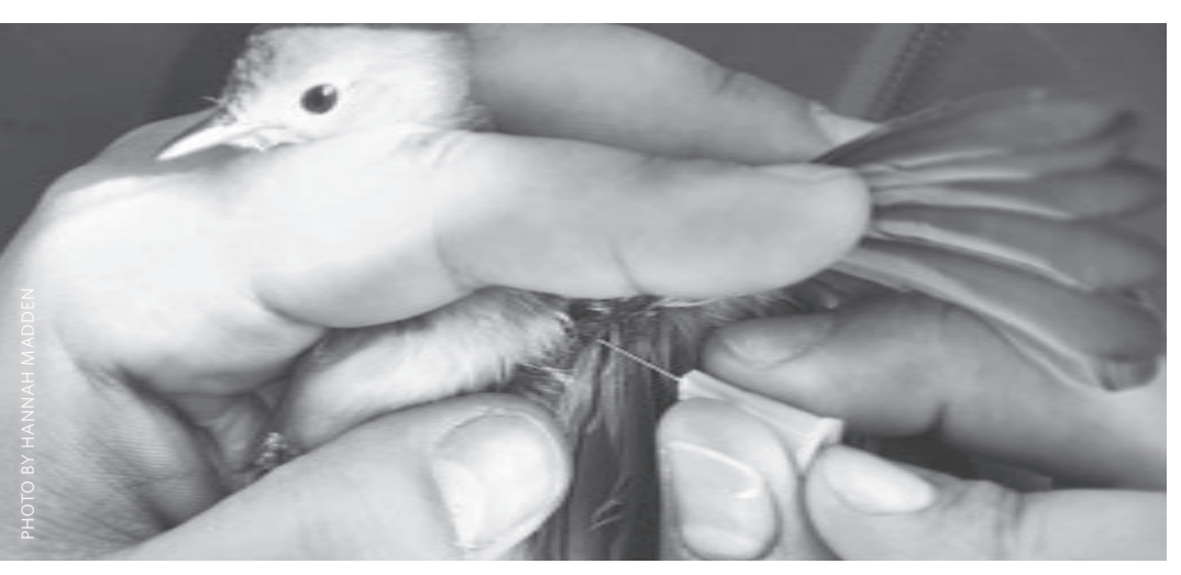
A small blood sample from this Yellow Warbler will be used to extract DNA to study the relationships of Yellow Warblers across the Caribbean and to determine what blood parasites they carry.

Most people associate the Caribbean Islands with beautiful beaches and tropical breezes, but for researchers at the National Aviary and their colleagues, the Islands serve as a natural laboratory for studies of malaria in birds.